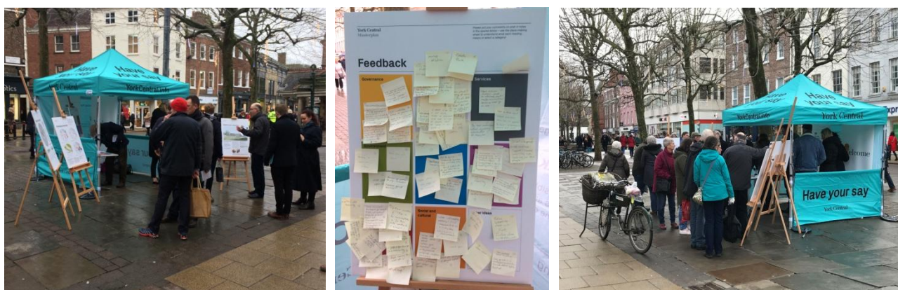
Pop-up event at York Residents Festival January 2018

More detail on each of these principles is given in Annex 1 at the end of this Framework.